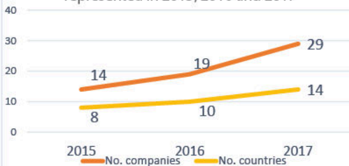
Number of participants and countries represented in 2015, 2016 and 2017